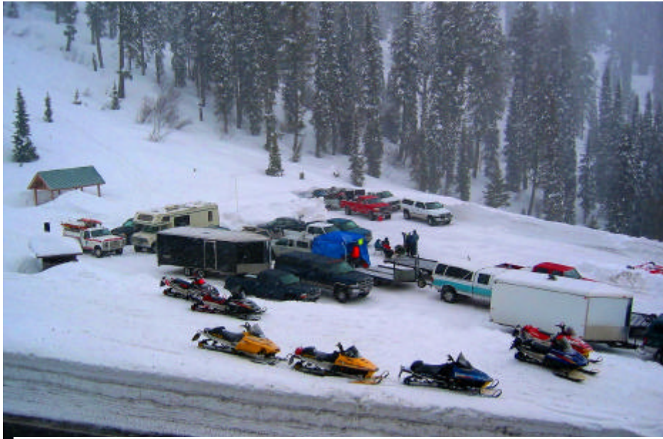
Search Base in the Mores Creek Summit parking lot.