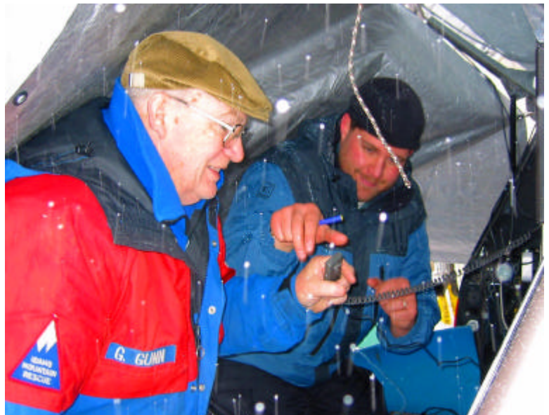
Ham Radio volunteers provided vital communication, setting up a phone patch with Boise and the Sheriff's office.