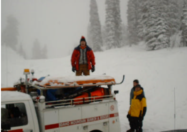
Packing up the equipment after the search was suspended due to weather related safety concerns. Note the visibility.