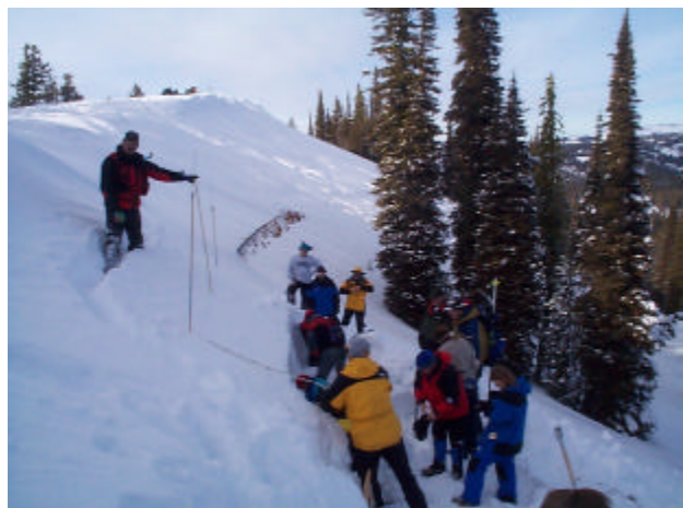
Sawing with a knotted rope.

IMSARU is not often called to assist in avalanche searches, because we are several hours away from most avalanche terrain. However, we routinely do searches where there is avalanche danger, so this training could save our own lives. We offer sincere thanks to Valley County SAR for working with us and hosting the field training.