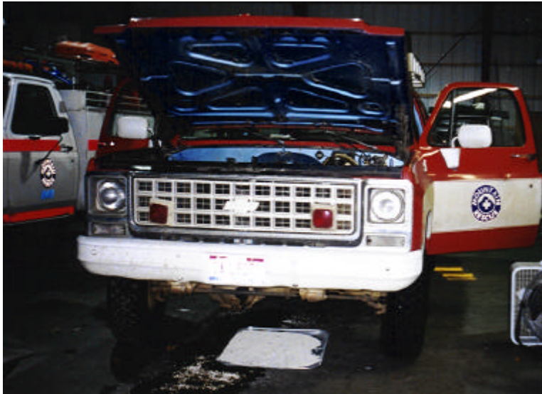
Yes, that is transfer case fluid all over the floor.

And it needs to be retired. Our workhorse 901 has multiple problems—unsafe tires, leaking vital fluids, doors that won't shut completely, to name a few—and it is too old and tired for us to invest a lot of money in it and expect it to continue our kind of work for more years.