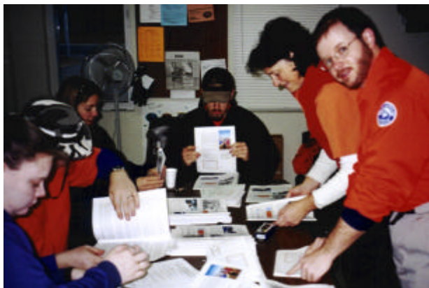
Many hands make quick work of putting the newsletter together.