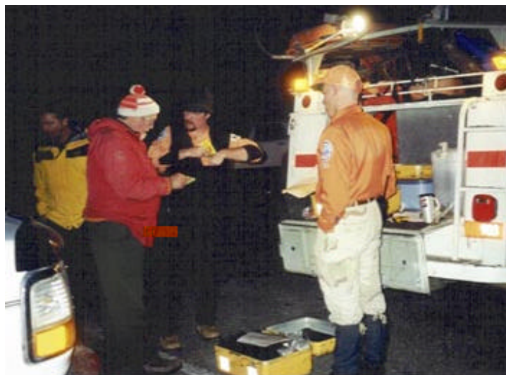
Planning in a cold, dark parking lot.

The call came in at approximately 10:30 on Friday night—two hikers lost in the fog up in the foothills—and the Ada Co. Sheriff’s personnel briefed us at the rendezvous point: A person across town near Gowen Field had reported picking up a call from a family service radio, saying that a man and his wife had been hiking in the foothills and had become separated in the fog. The subject didn’t know where he was nor where he had lost contact with his wife. The only reference point the RP was able to obtain was that they had traveled up Bogus Basin Road and had started on a trail across from a Volkswagon bus parked on the side of the road. The Sheriff’s Office located the bus at approximately mile marker two, and was able to contact the owners of the bus and confirm that they were not the reported lost party. Before our involvement, the Sheriff’s personnel had spent around