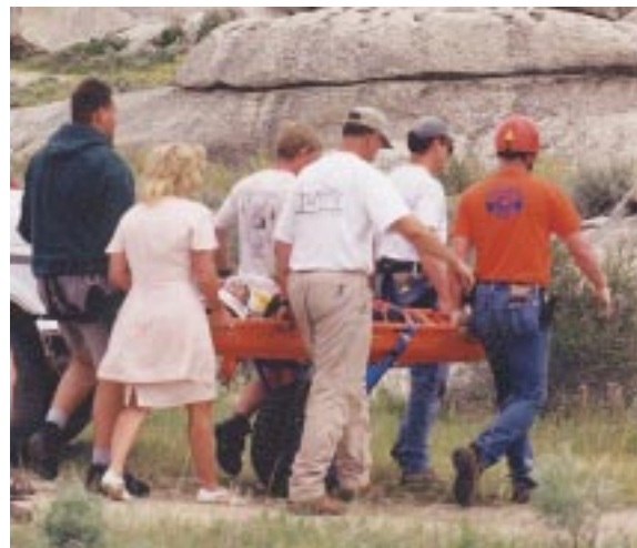
Almo QRU, Elmore County and IMSARU team members transport injured climber to the LZ.