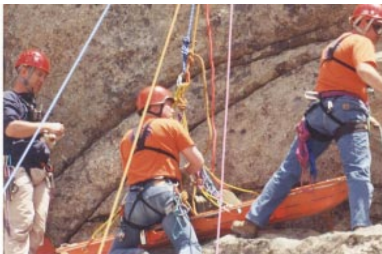
Bonneville County and IMSARU team up to rig the litter.

Sometime during the night or early morning, two dummies, one reported as having “rocks for brains,” were climbing on a rock face, hurt themselves and needed evacuation. The two dummies were practice victims for our first exercise, a high-angle pickoff. (One was a Rescue Randy and the other was a duffel bag filled with rocks.) We established two mixed teams, and divided those into pickoff teams and ground teams. The pickoff teams scrambled up the side of the climb and began the task of establishing anchor systems for belay and load line direction change. The ground teams established two anchors for the belay and load