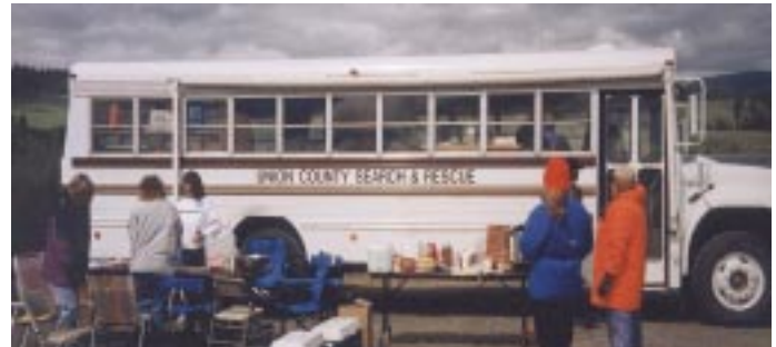
Union County's well equipped command center. If you go home hungry from a search in Union County, it is your own fault!

It was frustrating to not be able to help the grieving family, though not unexpected if the subject is in the deep water. The only positive parts of the day were the professionalism of those organizing the search (including Union County SAR's amazing hospitality again) and the way local people kept dropping off supplies—sandwiches, fried chicken, bottled water—for the searchers.