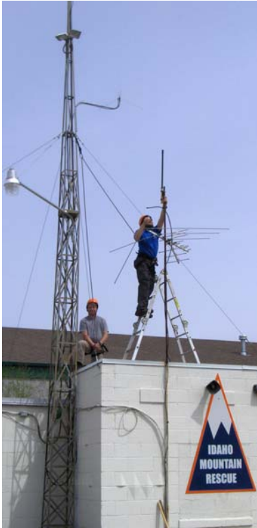
A technical exercise.