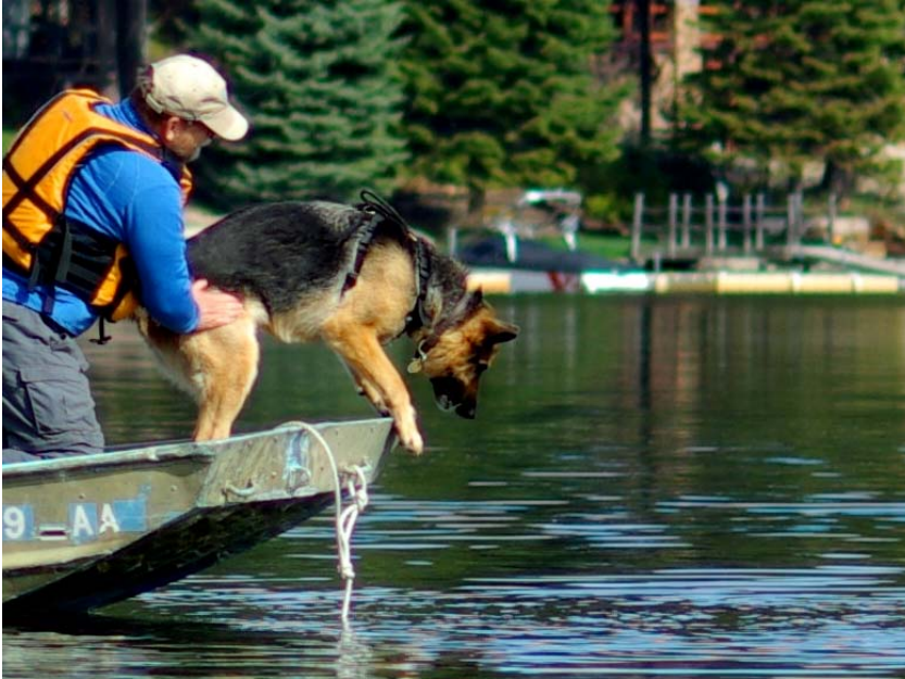
Winston steadies Skadi as she finds the scent.

We did worry right up to the last minute: Ice stayed on Payette Lake the latest it has in 100 years and snow cover prevented the usual outdoor maintenance. (Ponderosa Park couldn't open their campground for Memorial Day weekend despite having all spaces reserved.) And when things finally melted, it was rainy season. However, what's a little mud underfoot when you have a snug bunk in a heated building, warm showers as needed, tasty meals prepared for you three times a day, and the chance to train your dog for locating bodies under water?