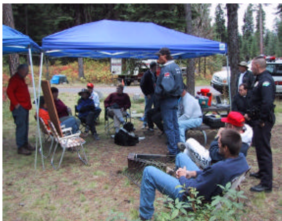
Learning from each other in our outdoor classroom.

It's hard to match up schedules for two groups to train together, but well worth the effort. IMSARU and the McCall Dive Team have worked many of the same drownings, and all agreed we could help each other more if we knew each other better. Since they have the lake, we drove up to Ponderosa Park. About half a dozen people from each unit met in our "classroom" at the picnic area beside the boat ramp.