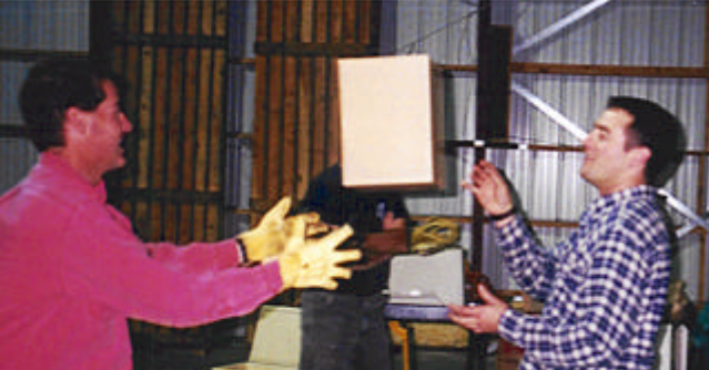
Cartons of bottled water float to new storage area.

Fall fell with a vengeance, frosting tomato and squash plants into oblivion, and IMSARU had not done the fall cleaning. In fact, corn booth parts were still scattered around the garage. An emergency call went out for “all hands.” The turnout was spectacular and the work flew...some say it levitated. Much of the “old meeting room” was emptied and cases of bottled water moved in--first by the armload, then carts were pressed into service; finally a human chain passed (threw) them into place.