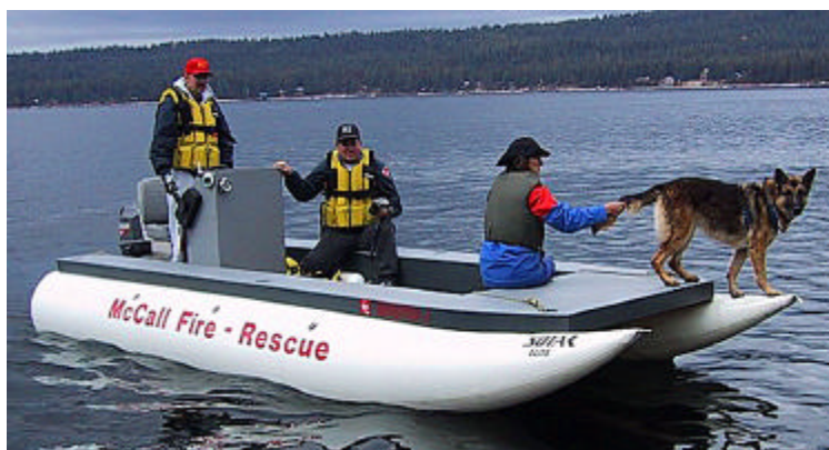
Hobo working from the McCall boat. The dogs loved this craft.