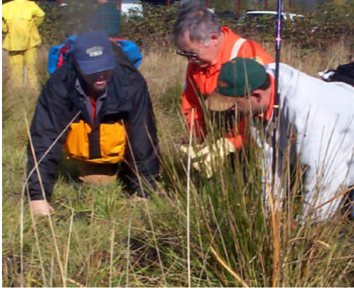
Tracking is a hands-on, up-close activity.